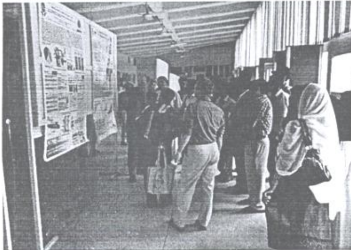
Poster session during the international conference

research work on different renewable aspects and success stories during the sessions.