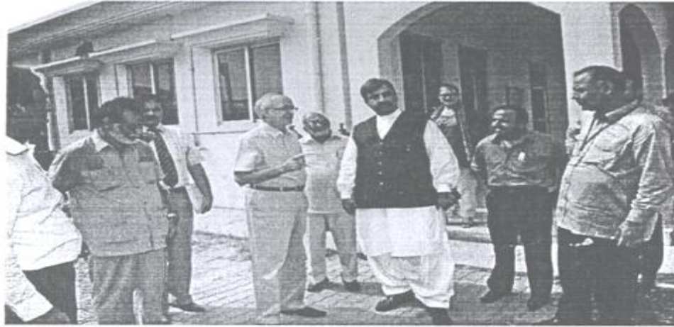
Vice Chancellor briefing to Energy Secretary about the solar systems developed during ICDD Project